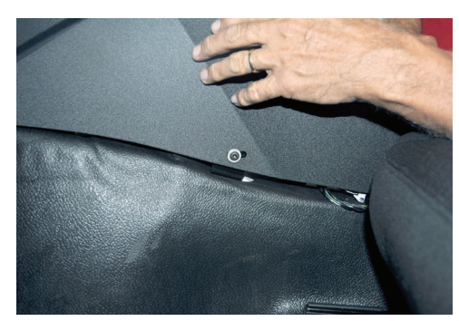
Secure front mounting bracket to D/S of console using provided 10-32 socket head cap screw.