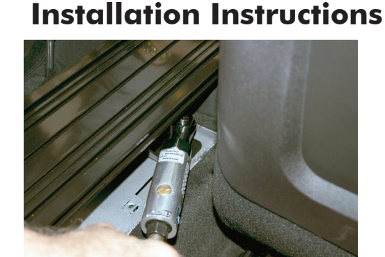
Remove (2) 8mm mounting screws at the rear mounting point of the aluminum floorplate. Screws will be re-used. This will allow the removal of the OEM aluminum floorplate and brackets.