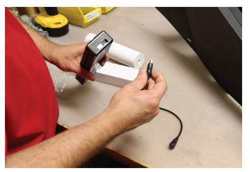
A 6 foot USB/Micro to USB cable is included. Secure one end into Brother printer and the other into the computer USB port.