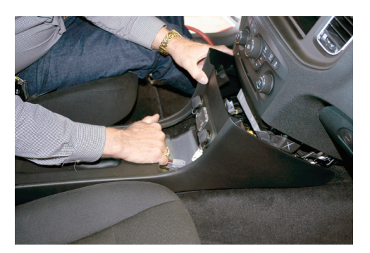
With both hands, grasp the plastic OEM console on both sides and pull directly rearward to release.