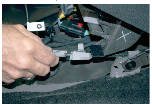
Disconnect wiring harness for 12V and USB from OEM console.