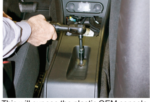
This will expose the plastic OEM console. Remove (1) 10 mm flange nut from center of plastic console. Nut will be re-used.