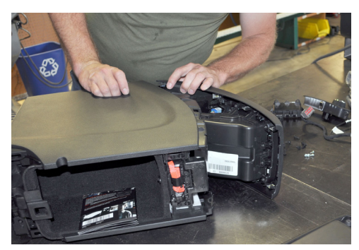
Now pry rear OEM cover from console.

Note: Some vehicles may have a coin tray only without Traction Switch.