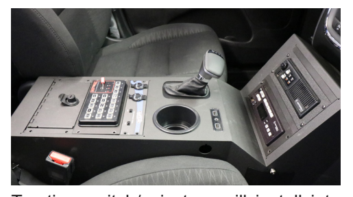
Traction switch/coin tray will install into faceplate opening.

Note: The Manual Park Release is accessible through side access panel.