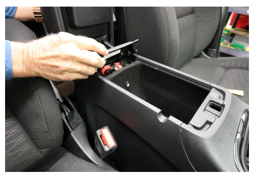
Pry up manual neutral cover located under armrest near the hinge.