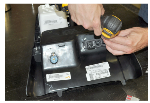
Using a T20 bit, remove (4) screws and set aside media component to remount into Contour Console.