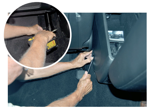
Move seats forward, use a flat head screw driver to expose and then remove (2) 10mm bolts.