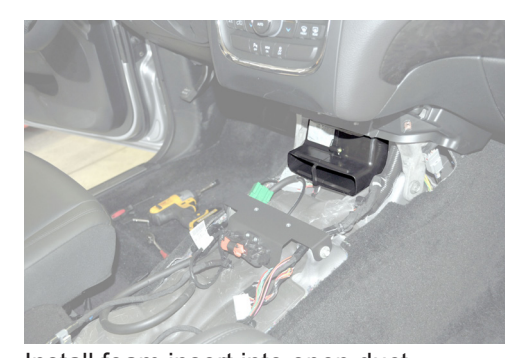
Install foam insert into open duct.

Console. Note: See owner's manual section "What To Do In Emergencies" for more Park Release information.