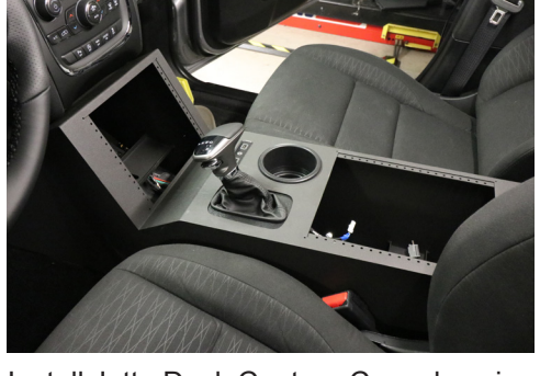
Install Jotto Desk Contour Console using 5/16 button head cap screws.