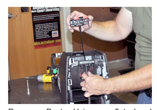
Remove Duct. Using a flat head screwdriver, pop out clips holding cable in place. Then pull cable through, and remove cable clips. Set aside Manual Park Release to be reinstalled into the Contour Console.

Note: See owner's manual section "What To Do In Emergencies" for more Park Release information.