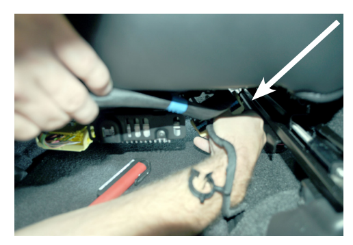
Disconnect wire harness under P/S seat by unlocking the lever, and pulling wire connector apart.