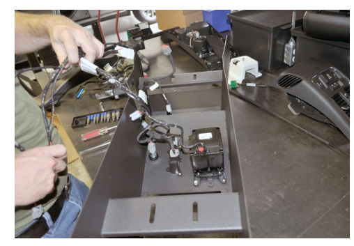
Reinstall components back into Jotto Desk Contour Console using the same hardware from OEM console.