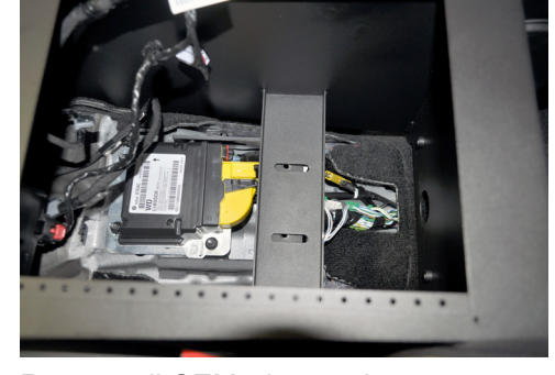
Reroute all OEM wires and reconnect.

Note: The Manual Park Release is accessible through side access panel.