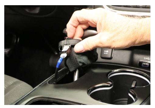
Pop up shifter boot. Unscrew bolt on shifter with T20 bit and unplug wire cord.