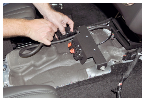
Attach Forward Mount Bracket into vehicle reusing (2) 10mm bolts. Once installed, route/connect Manual Park Release cable making sure that wire will not be pinched by Jotto Desk Contour