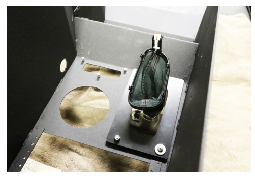
With the console turned over, install the boot and shifter and re-tighten T-20 screws. Snap the boot clips into the Filler Plate.