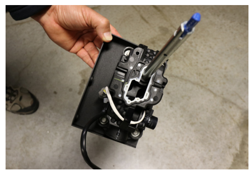
Secure shifter to Mount Plate with factory OEM bolts.