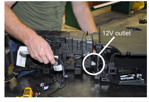
Now, with all components out of OEM console, remove any remaining wiring and 12V outlet from inside storage box. Set aside OEM console substructure.