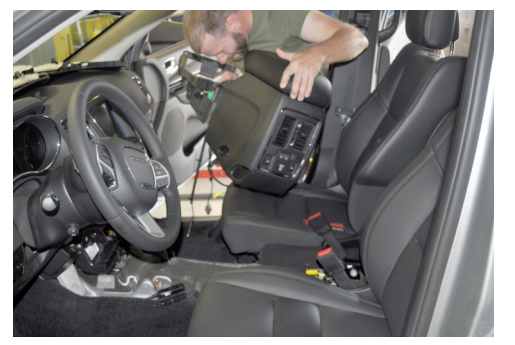
Remove OEM console from vehicle.