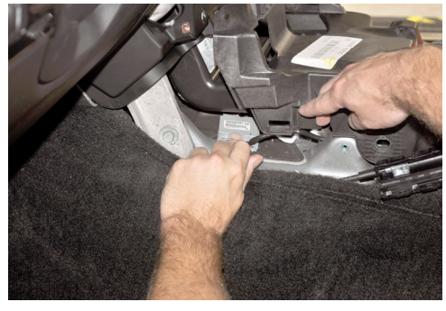
On the driver side of center console, unsnap Manual Park Release cable from OEM substructure.