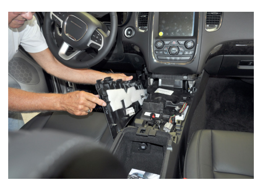
Pop off front left/right side panels from OEM console.