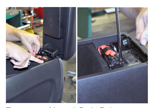
To remove Manual Park Release, you will need to remove (3) Phillips screws and set arm rest aside. Then remove (2) Phillips screws that are exposed.

Note: See owner's manual section "What To Do In Emergencies" for more Park Release information.