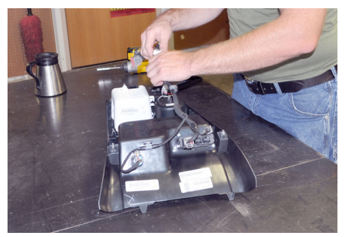
With OEM console out of vehicle, begin to remove all components from console. First, remove media wire harness.