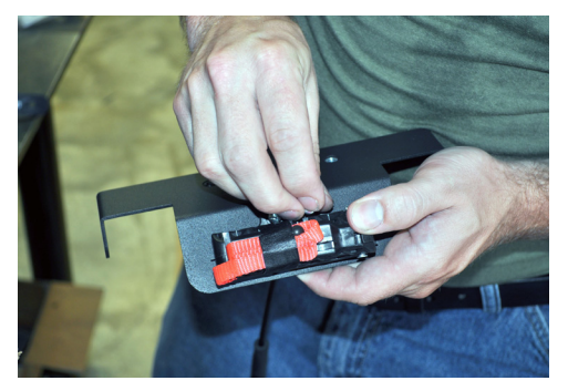
Using 5/16" hex head bolts, attach Manual Park Release to Forward Mount Bracket.