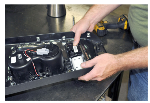
Traction switch/coin tray will pop out from underside of OEM console. Set aside.

Note: Some vehicles may have a coin tray only without Traction Switch.