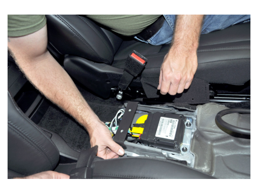
Attach Rear Mount Bracket with OEM (2) 10mm bolts.

Console. Note: See owner's manual section "What To Do In Emergencies" for more Park Release information.