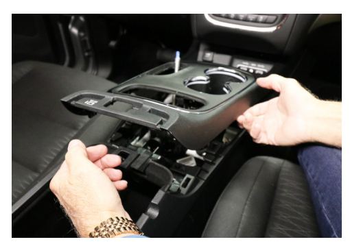
Pry up top/center OEM console. Disconnect all wires from top cover.