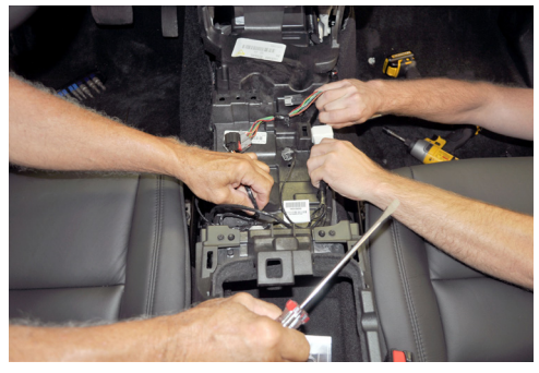
Disconnect wiring harnesses and harness clips.