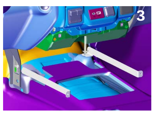
Attach the Lower Left and Lower Right Support Brackets to the OEM studs located by the main center dash supports. Loosely secure with provided flange nuts.