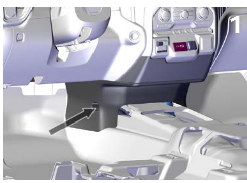
Remove 7 mm screw located on the driver side lower trim.