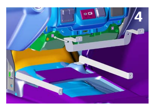
Attach the Upper Bracket to the dash with provided M4.2 x 1.41 x 2.0 screws. Tighten into place.